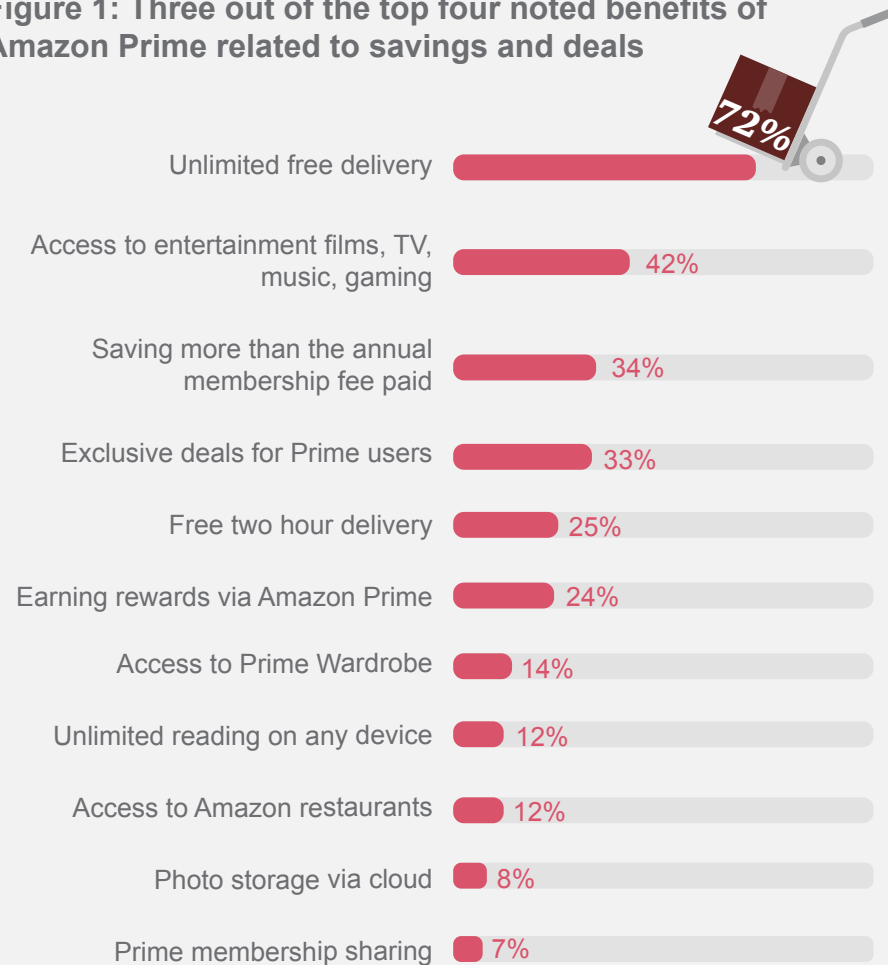
Figure 1: Three out of the top four noted benefits of Amazon Prime related to savings and deals

Q: What are the main benefits to you of using the Amazon Prime service?