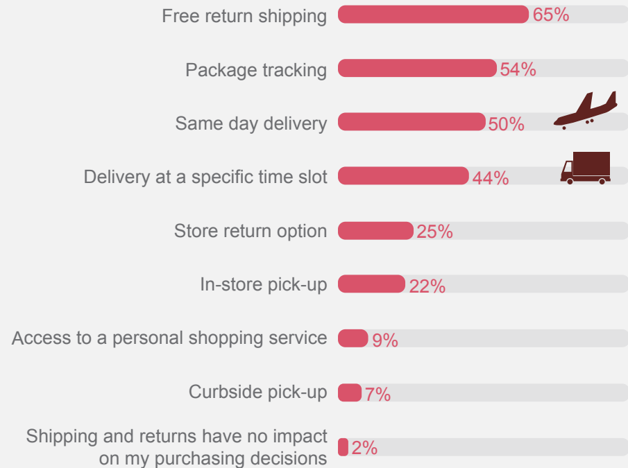
Figure 2: Consumers value free return shipping and quick deliveries as attractive benefits

Q: Retailers may offer various options for how you receive your goods. Which of the following services are most attractive to you if offered at no extra cost?